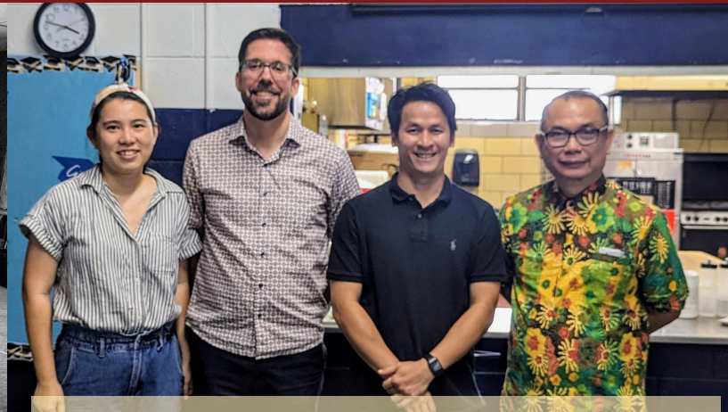
NSM Staff and Members from St Thomas Aquinas