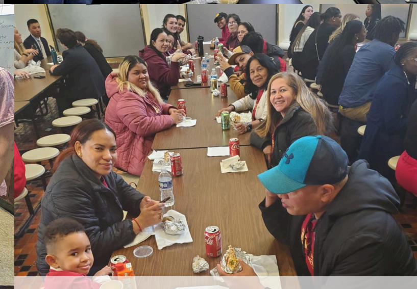
Driver's License Committee at the State Capital in Harrisburg