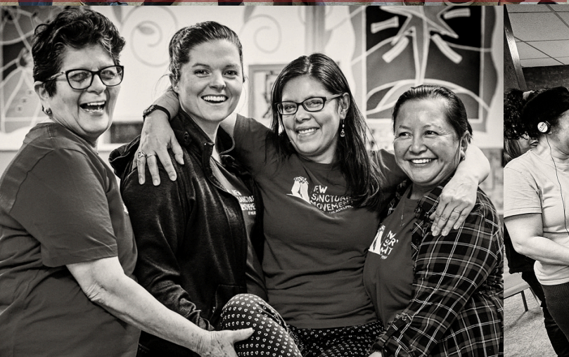
2023 Staff Retreat