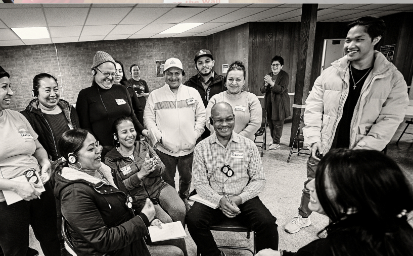
Leadership Program, Cohort 2