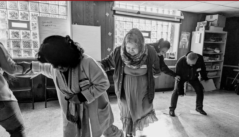
Leadership Program, Cohort 1