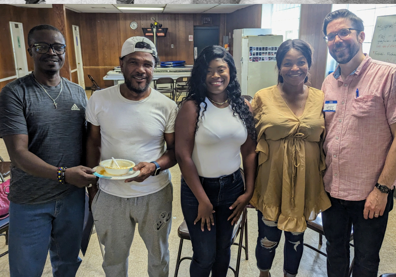
NSM Members Sharing a Meal