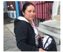
Reina has 2 children.